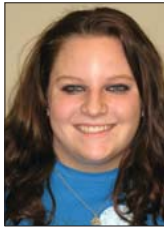
Autumn Appis 4-H