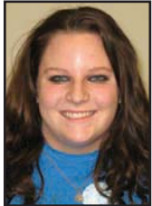
Autumn Appis 4-H