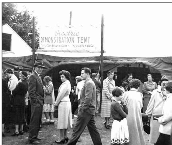
COSHOCTON COUNTY FAIR. YEAR IS EARLY 1950'S.

Winners of Classes 1, 2, and 3 this year and previous winners of Senior Showmanship or Supreme Showmanship.