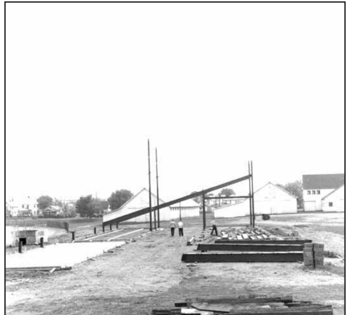
THE NEW GRANDSTAND BEING BUILT AT THE COSHOCTON COUNTY FAIRGROUNDS SUMMER OF 1954.

Junior Fair Beef Show and Dairy Show exhibitors have the option to haul animals into the fairgrounds on Thursday evening before the fair starting at 5 p.m.